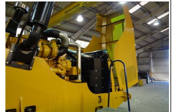
Forward tilting hood provides unmatched access to engine coolers and other components

GAME Equipment reserves the right to change specifications without notice. Some photos may contain optional equipment.