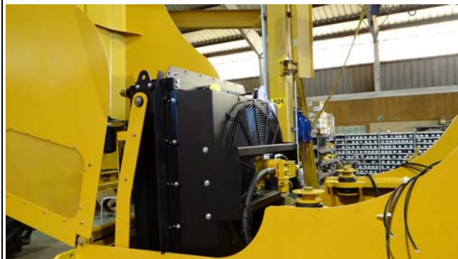
Proportional controlled, hydraulically driven, reversing fan stays clean and saves fuel