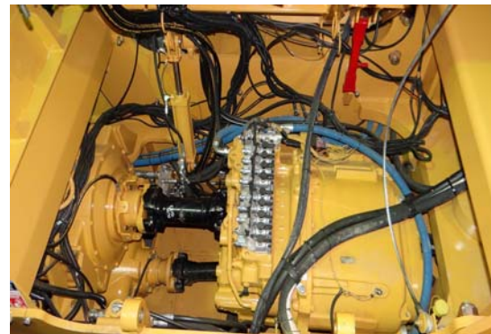
Tilting cab provides unmatched access to powertrain and hydraulic components